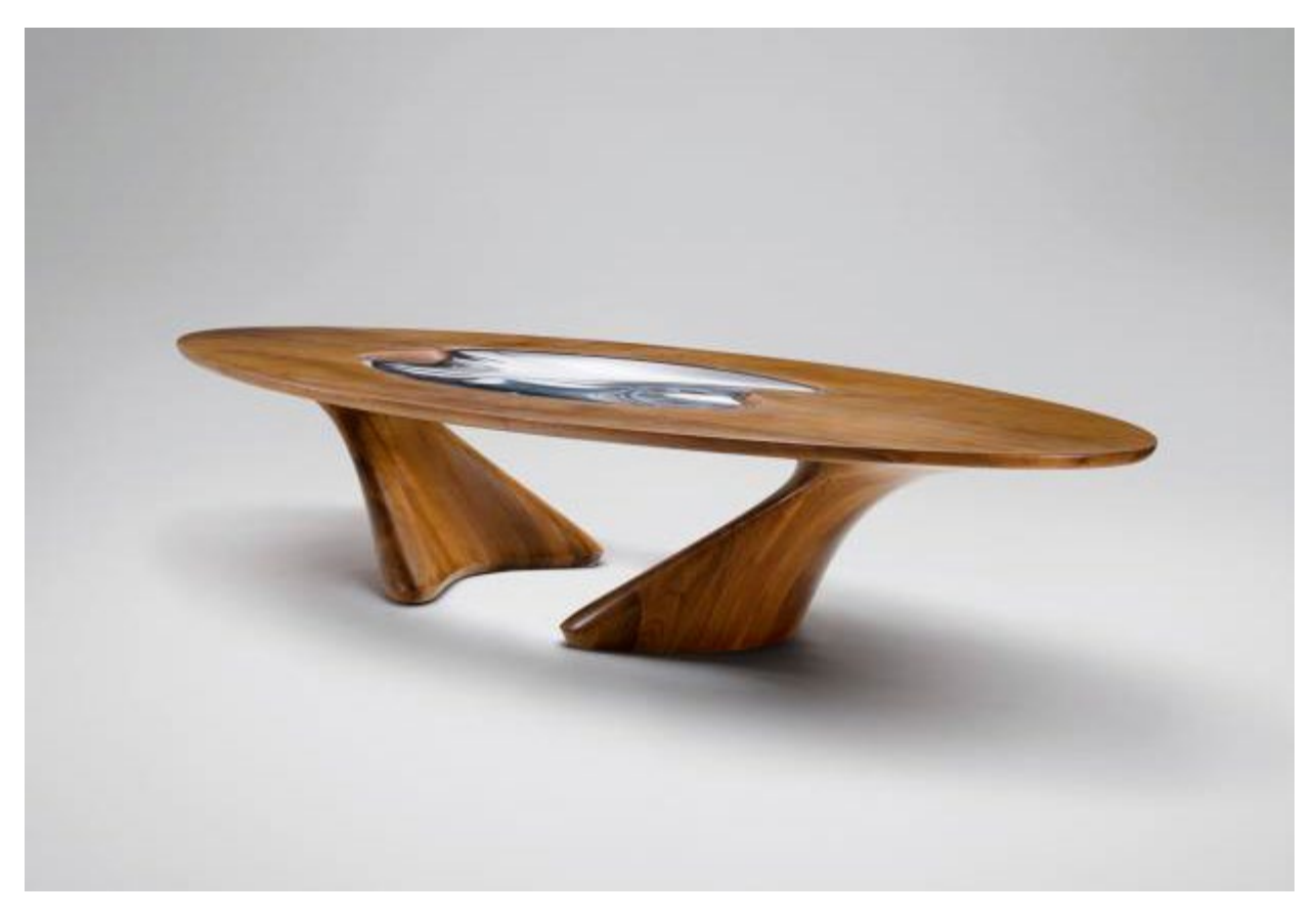
Zaha Hadid Architects American-walnut and acrylic UltraStellar dining table, from £198,000, from David Gill Gallery

skills and 21st-century techniques, makers are focusing on creating highly collectable curvilinear centrepieces for inspiring interiors.