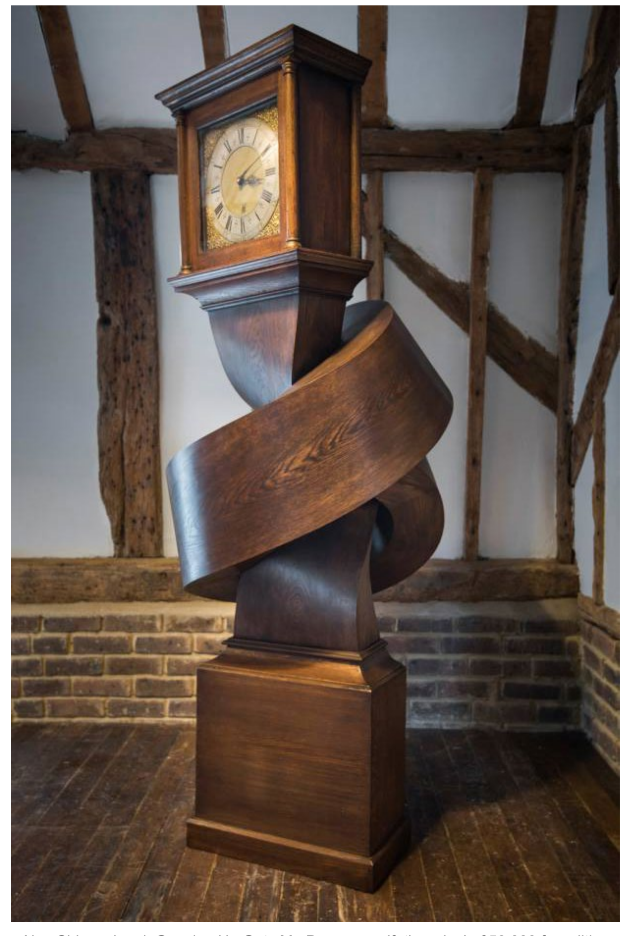
Alex Chinneck oak Growing Up Gets Me Down grandfather clock, $50,000 for edition