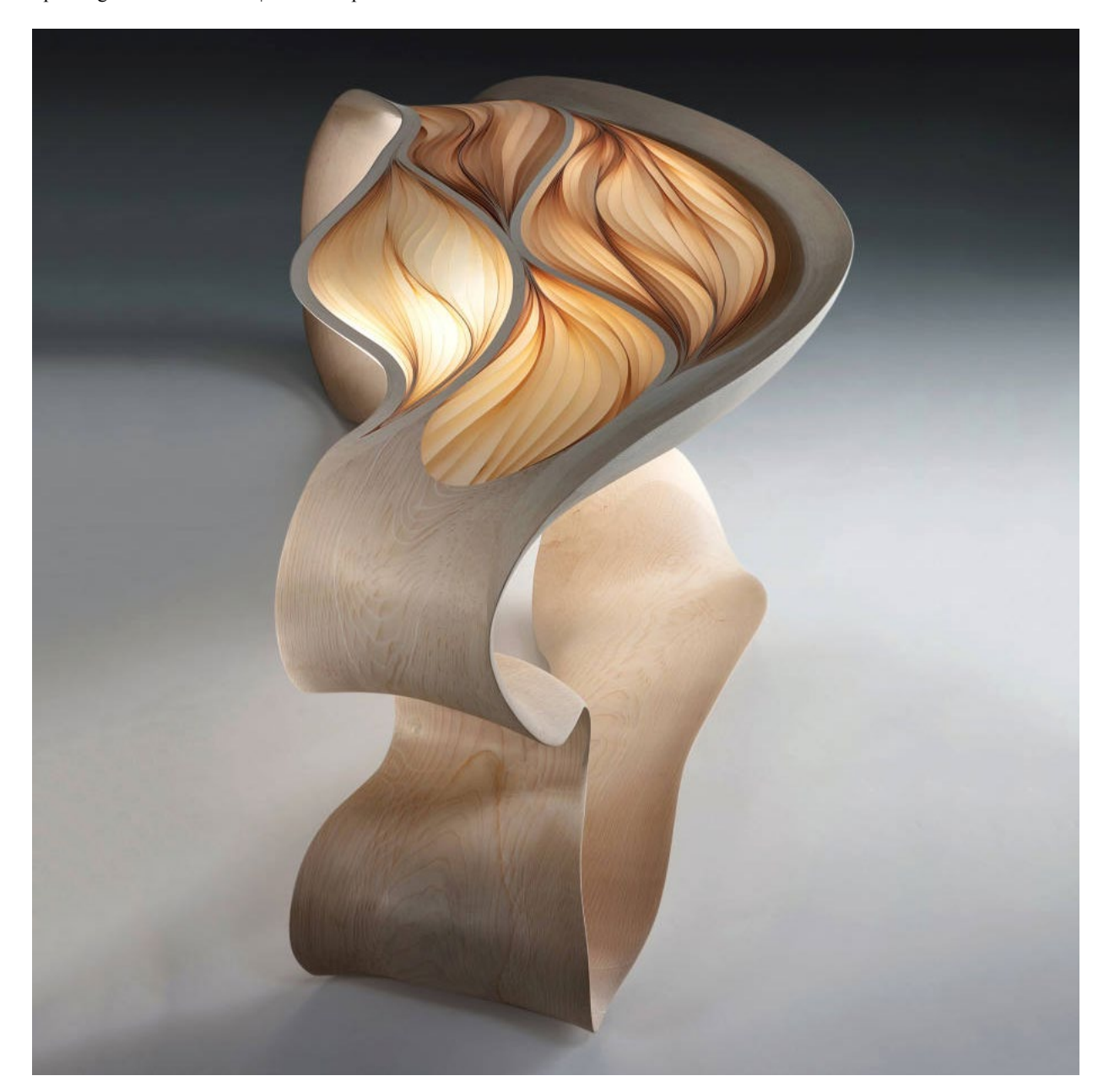
Marc Fish sycamore and acrylic Ethereal desk, $120,000, from Todd Merrill Studio