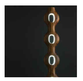
PROPERTY & ARCHITECTURE