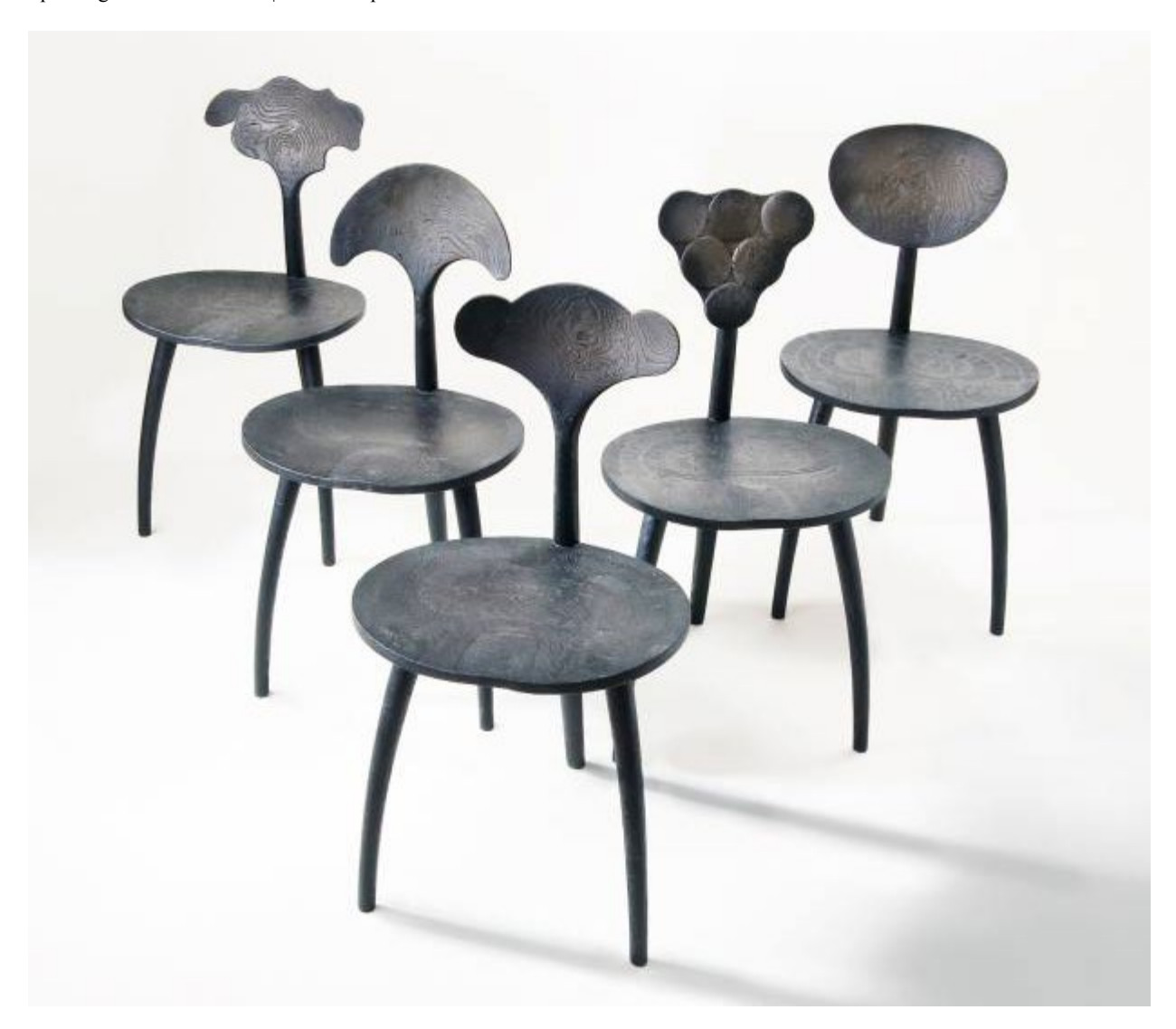
John Makepeace oak Black Trine Variations chairs, £14,400, from Sarah Myerscough Gallery

Makepeace's own exploration of fluid forms, spanning two decades, has produced the ground-breaking Flow cabinet (2006, made to order, £108,000), featuring a hand-shaped, digitally designed surface pattern of three-dimensional ripples, and the Undulate console (2016, from £25,000) with legs in carved and rippled sycamore. Recently, he has experimented with lamination. Black Trine Variations (2017, £14,400), created for Sarah Myerscough Gallery, is a series of three-legged chairs with internal metal connections made using technology "developed by Nasa for joining wooden blades to the metal hub of a wind generator on Hawaii". Each seat is made from 13 layers of English oak and the pattern results from the natural qualities of the timber, which has been sculpted and polished to reveal the